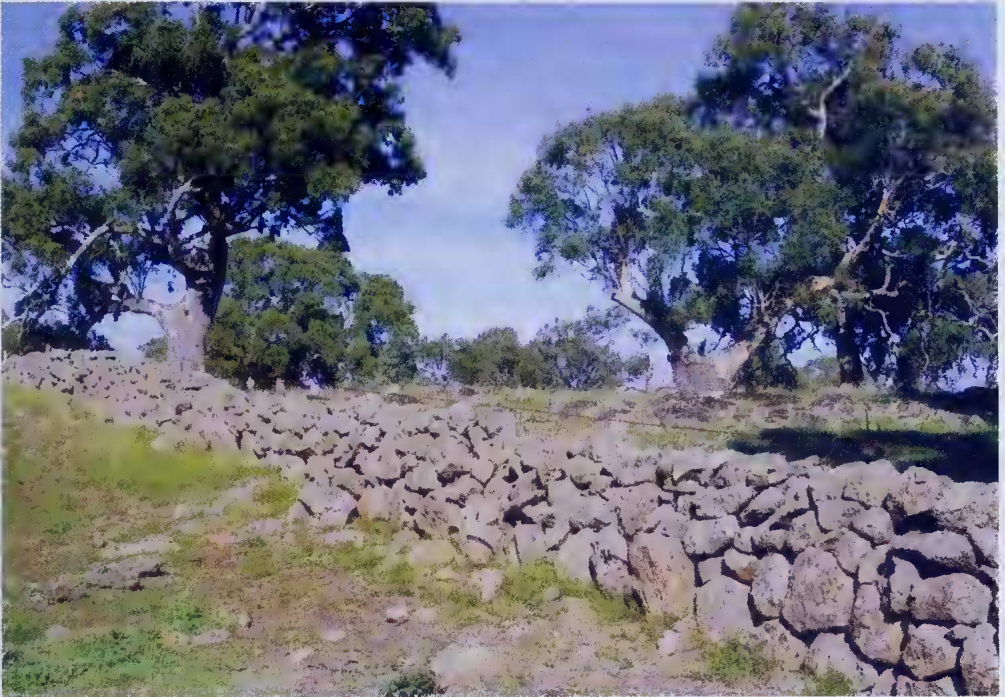
Fig. 1. Heritage dry stone fence at Growling Frog Golf Course, Yan Yean.

proximately 12 specimens of various sizes were detected along a 50 m section of the western boundary fence. The property was visited again on the morning of 3 May 2010, when several more Spencer's Skinks were seen on the western fence. On this occasion, one specimen was observed to catch a small grasshopper that had landed on the fence.